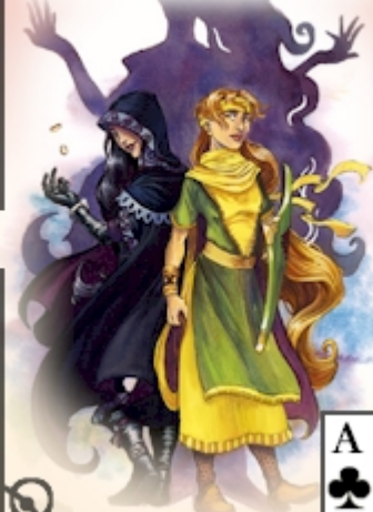
The Small Folk