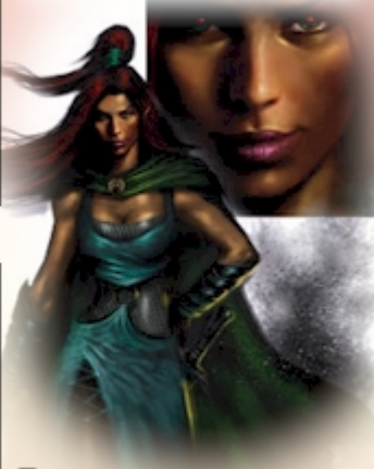
The Gregarious Neighbor