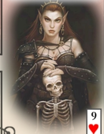
Life and Death