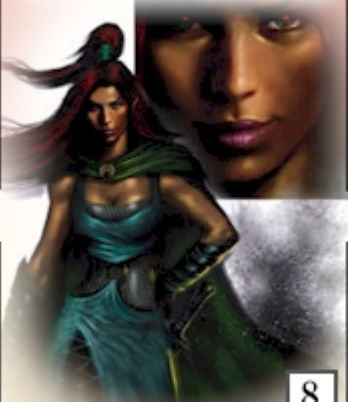
The Gregarious Neighbor